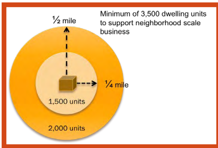
Figure 4 - Residential Units Needed to Support Neighborhood-Serving Businesses

These land-use patterns aren't compatible with suburban low density residential development unless commercial development can be located adjacent to residential uses. Few of the region's suburban neighborhoods allow this. The promise of neighborhood-scale business districts lies in walkable, mixed-use urban areas. These are the hard realities of a community vision calling for neighborhoods that offer more travel choices and less reliance on driving for every trip.