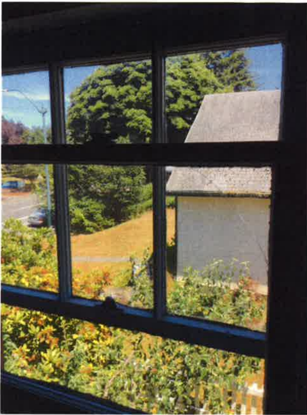
9 3rd floor hall broken window 2015