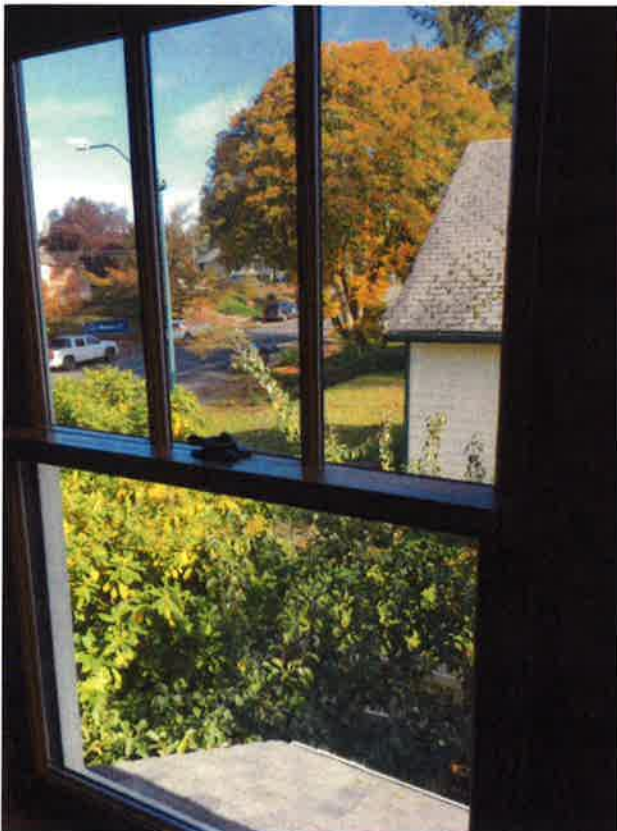
10 3rd floor hall restored window 2016