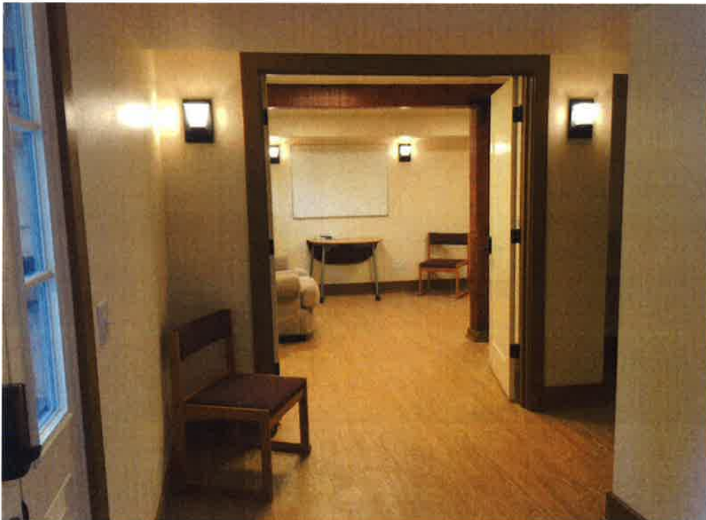
6 Ground level at West entrance looking left 2016