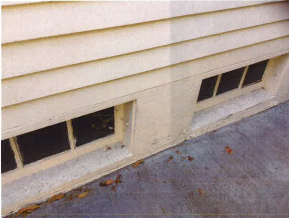
11 exterior basement windows 2015