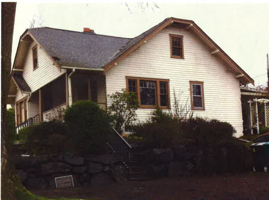
1 Exterior Elevations North and West 2015