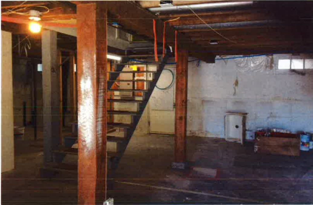
3 Ground level at West entrance 2015