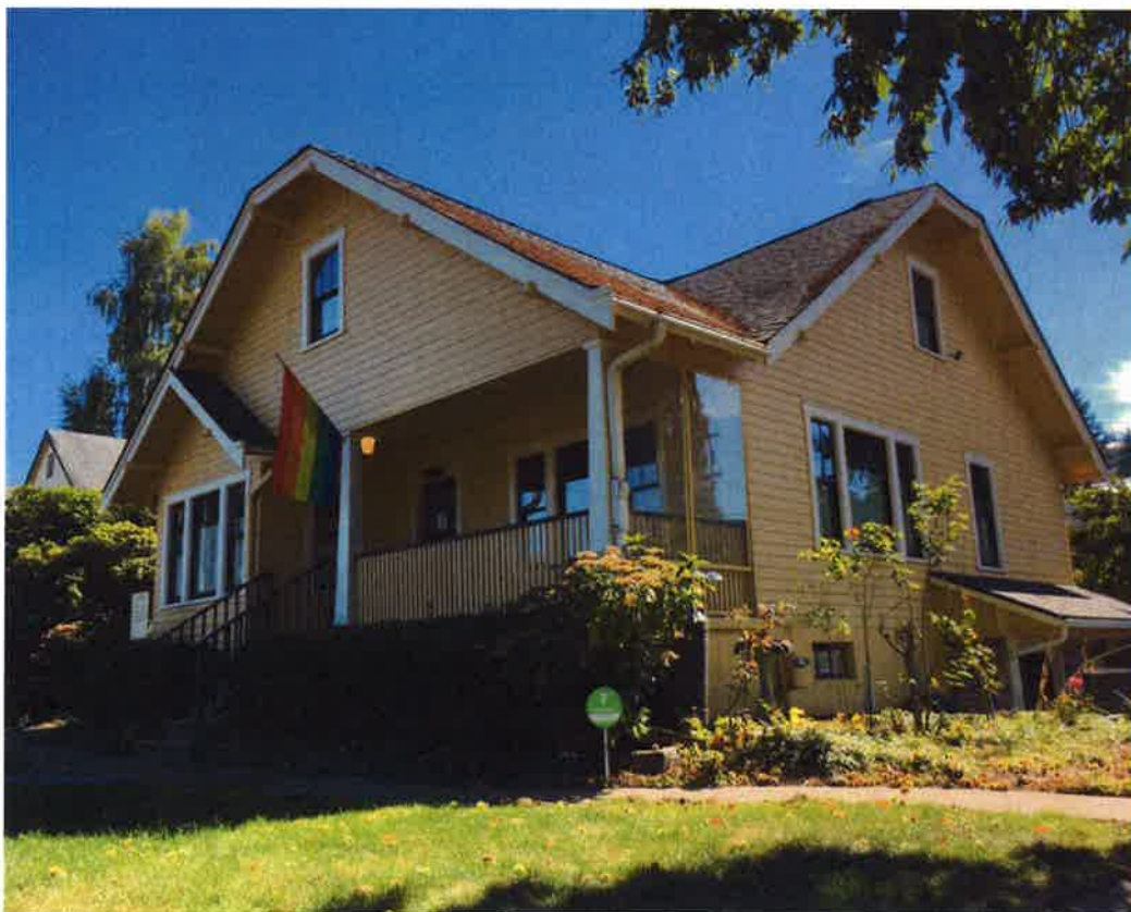
2 Exterior elevations North and West 2016