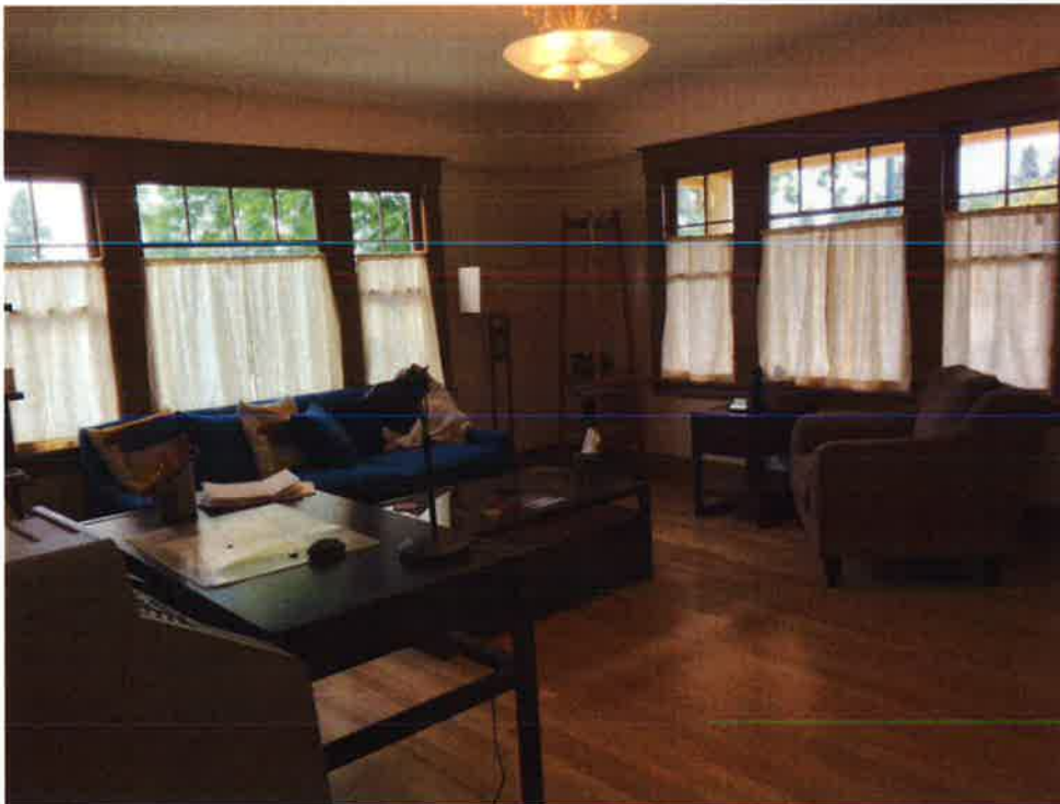
8 2nd floor main room 2016