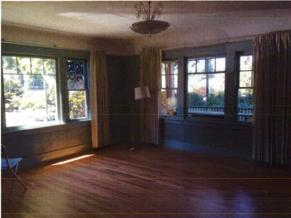
7 2nd floor main room 2015