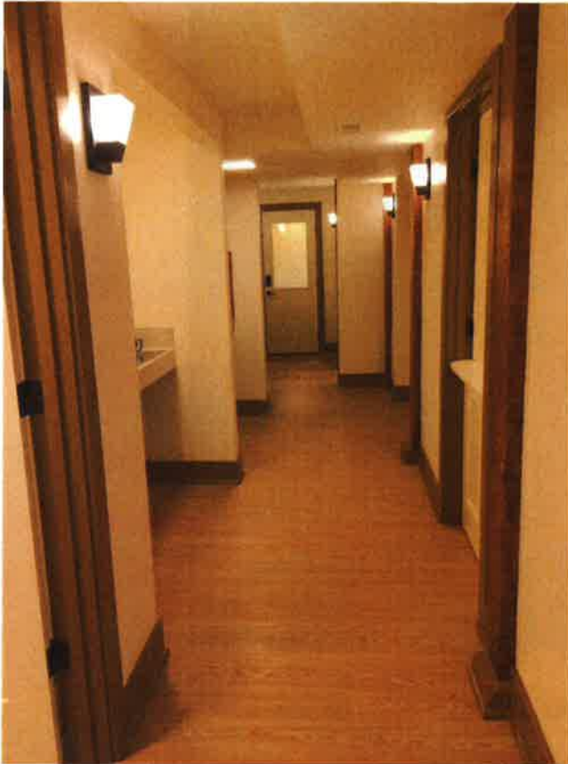
5 Ground level at west entrance 2016