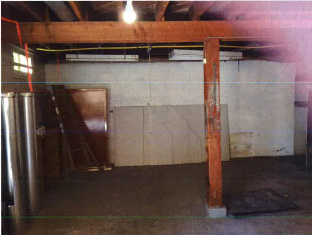
4 Ground level at West entrance looking left 2015