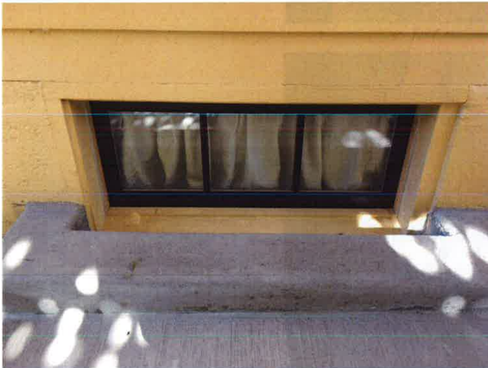
12 Exterior basement window with well 2016