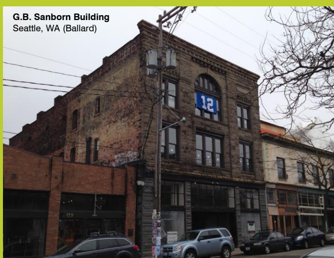
G.B. Sanborn Building Seattle, WA (Ballard)

For enabling legislation, see RCW 84.26 and administrative rules WAC 254-20 and WAC 458-15