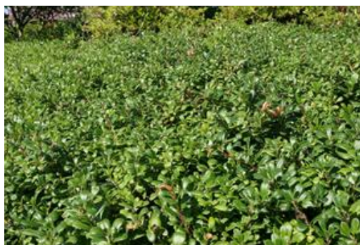
'Massachusetts' cultivar again