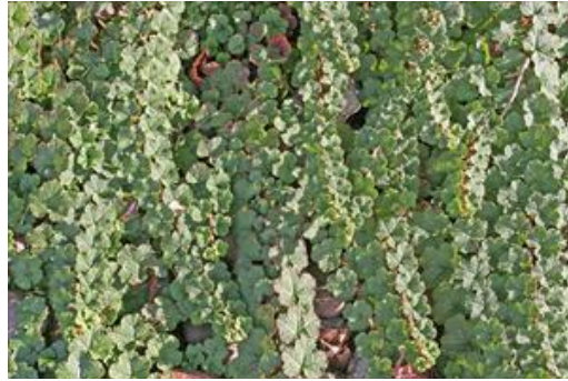
Complete coverage of the soil