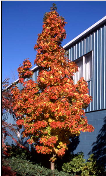
© J. Frank Schmidt & Son Co.

Sugar maples grow best in well drained soil, but are very tolerant of sandy and clay conditions. Full sun to light shade will give the most intense fall color. This compact columnar form will grow best with regular summer watering. Prune to prevent rubbing and crossing branches in young trees; as they mature very little pruning is needed.