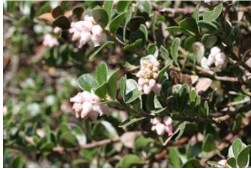
Cultivar 'Vulcan Peak'