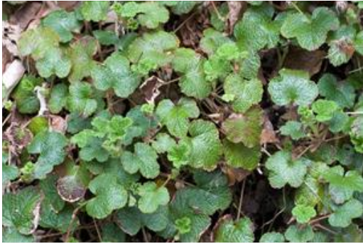
Cordate leaf base