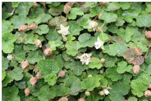
Leaves and flowers in May