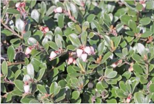
Bloom on bear-berry