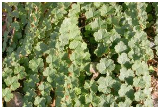
Stems trailing down a hill-side