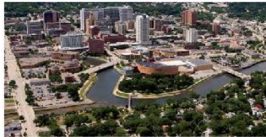
1. Rochester, MN LIV SCORE 695 Population: 110,275