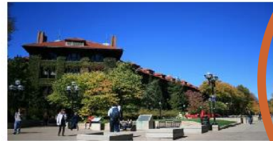
3. Ann Arbor, MI LIV SCORE 674 Population: 116,194