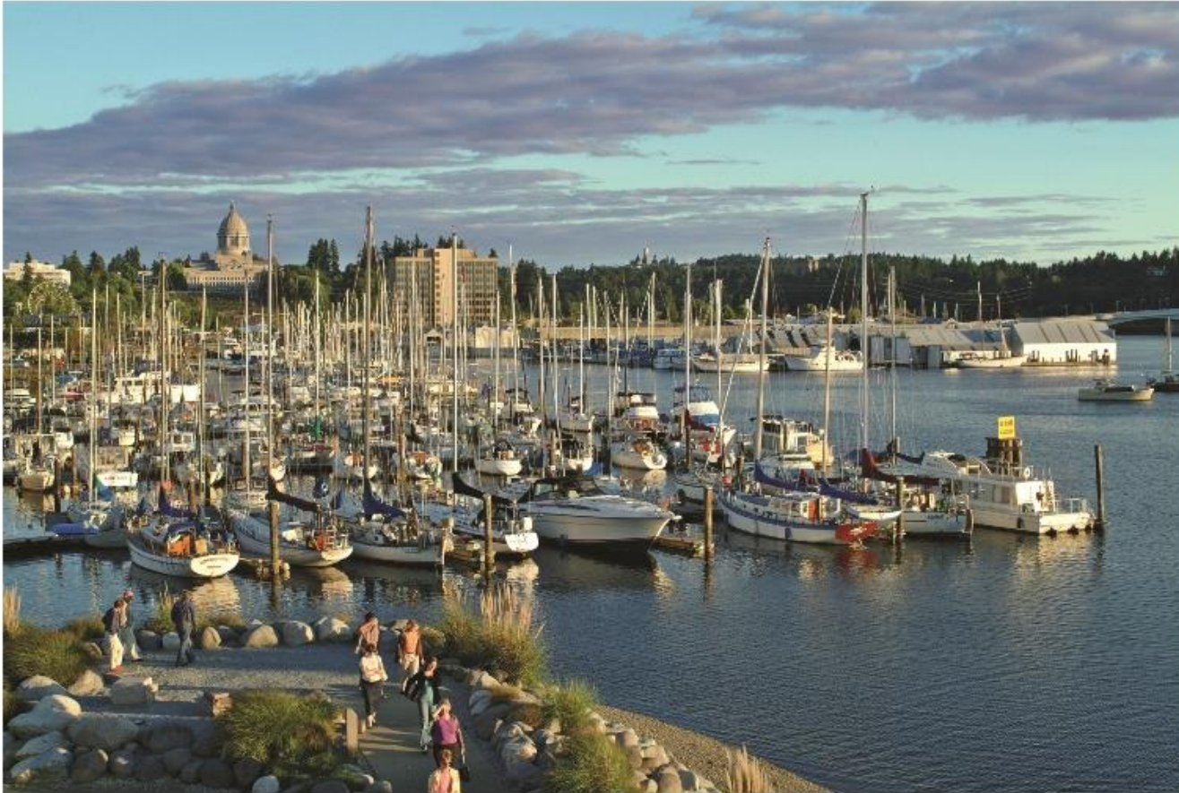
OLYMPIA-LACEY-TUMWATER VISITOR & CONVENTION BUREAU