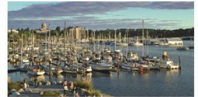
4. Olympia, WA LIV SCORE 672 Population: 48,941