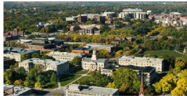
2. Iowa City, IA LIV SCORE 678 Population: 71,832