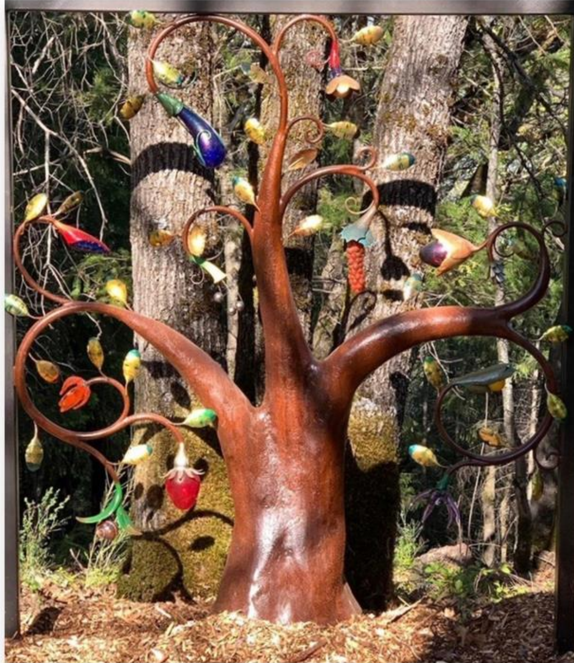
Tree of Life

steel, copper, stainless steel, glass, lighting