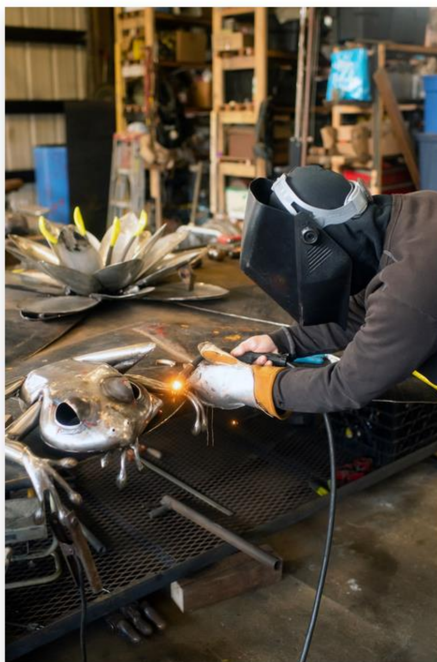
Beyond the Surface (in progress)

stainless steel, weathering steel, glass, glass enamel