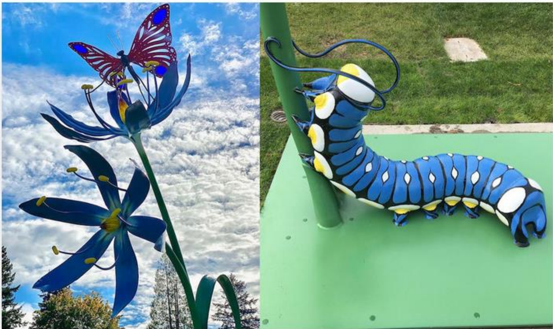
Metamorphosis (close up) steel, stainless steel, glass, lighting 18' x 10' x 4'