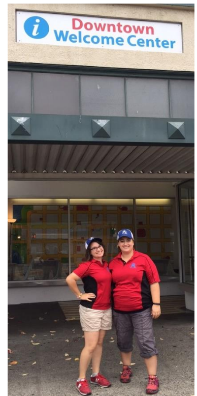
The Capital Recovery Center's Downtown Ambassador Program provides assistance to homeless and mentally ill people. PY2014 CDBG Funding: $51,270

While economic development was identified as the highest priority in the current Five-Year Consolidated Plan, activities in the other four identified strategy areas are also eligible. Additionally, the Council could add other CDBG-eligible strategic goals based on current conditions not anticipated at the time of the Five-Year Consolidated Plan development.