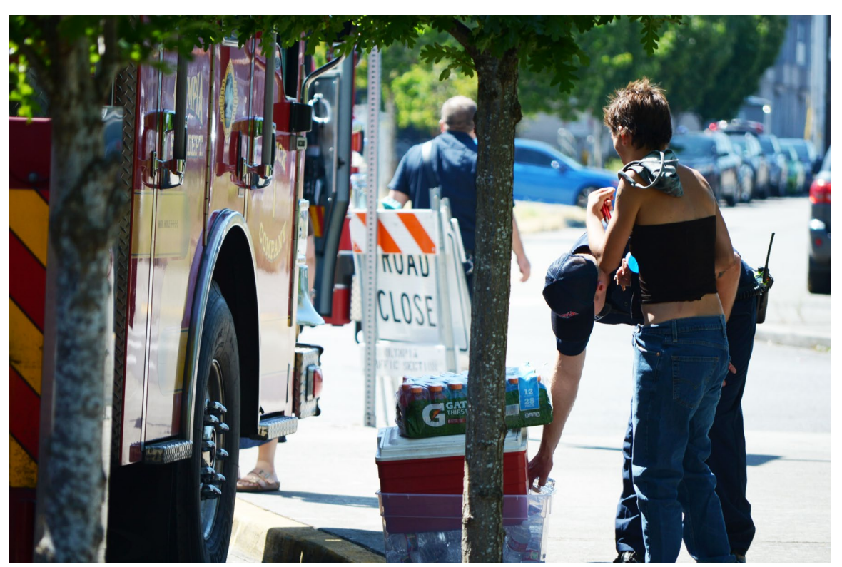
Olympia Fire personnel rendering assistance

The Department's core values include: stewardship, integrity, compassion and professionalism. The OFD mission is to respond rapidly, with highly training professionals to mitigate emergencies for our community. We are dedicated to reducing risk through prevention, fire and medical education, and disaster preparedness.