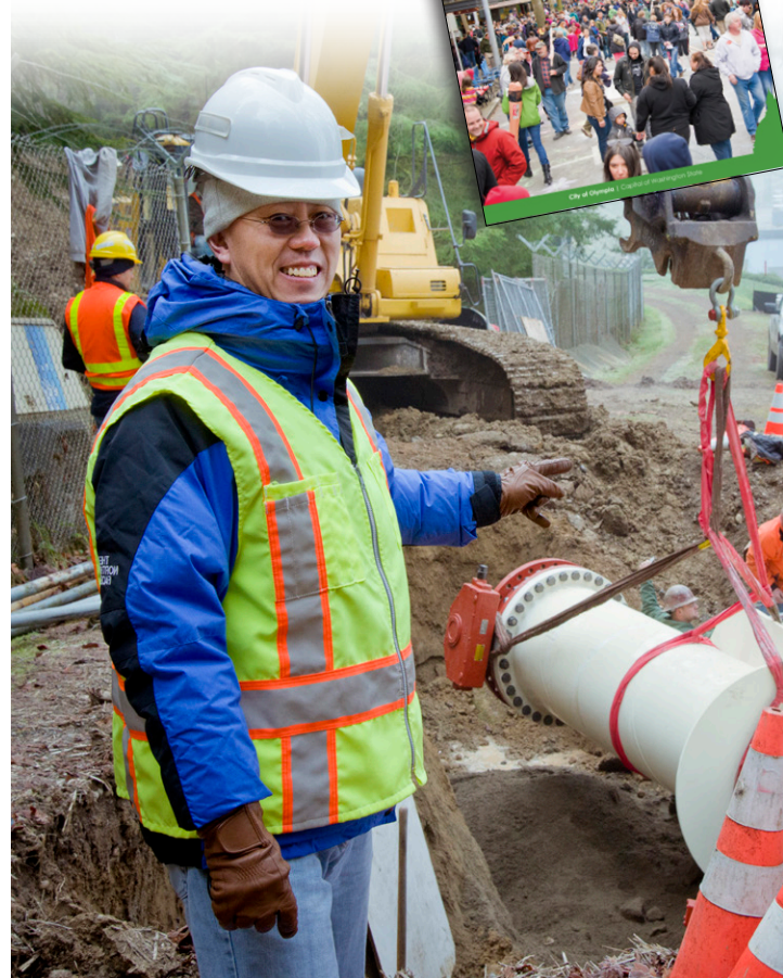
Moving from Visioning to Action