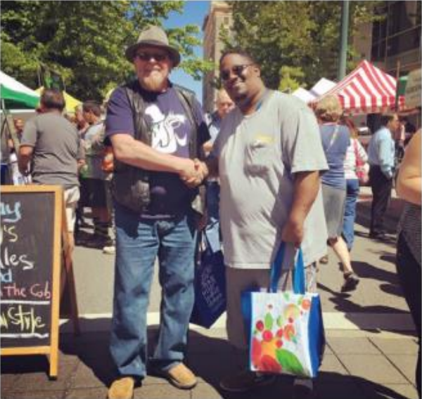
Participants in the SNAP Ambassadors program, Tacoma Farmers Market.