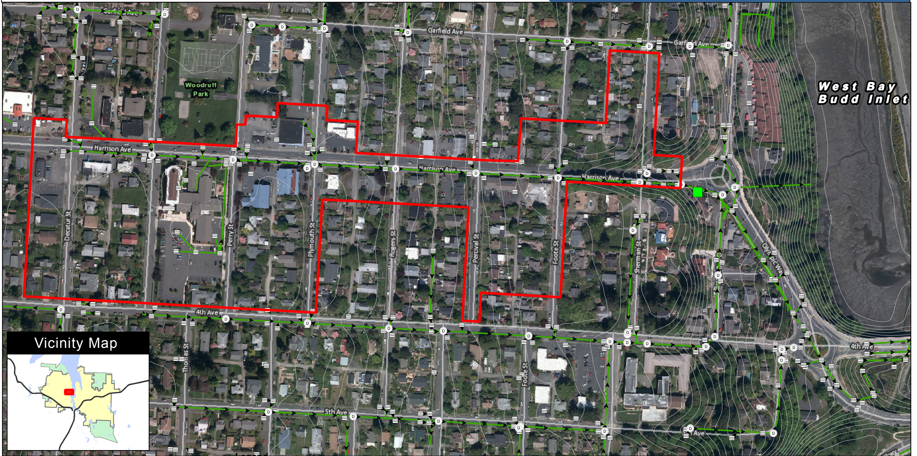
Figure 1. Project Map