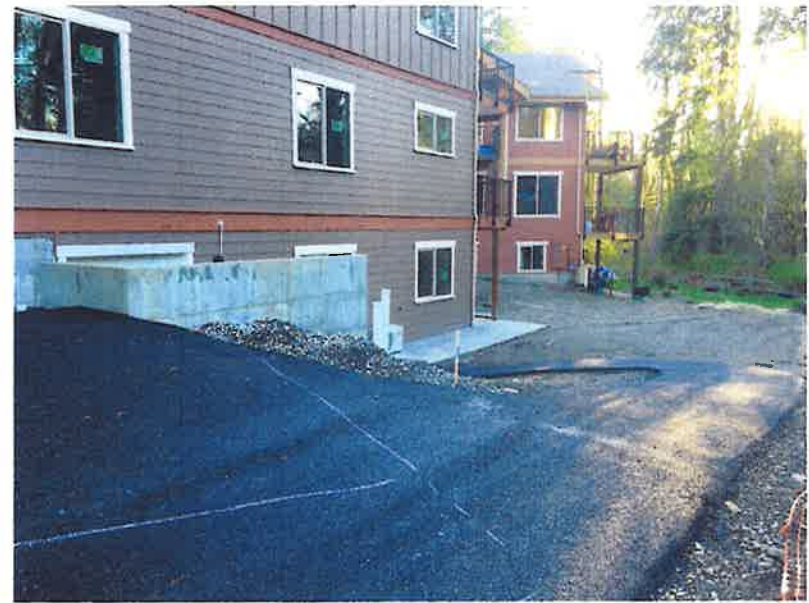
Down bike path toward wall in front of bike storage