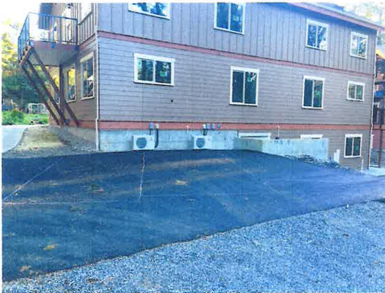
Picture from narrow west end of Muirhead