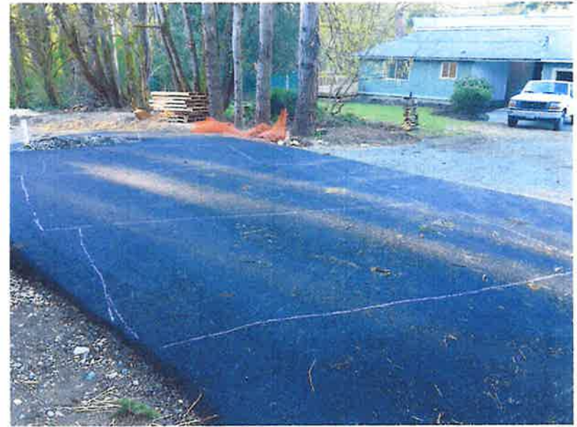
From corner accessible to sidewalk, looking NW