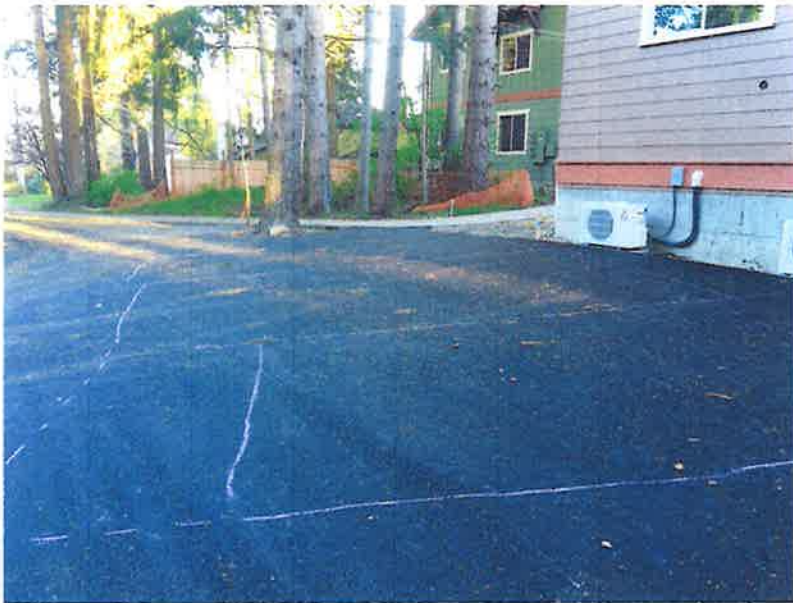
Picture from top of bike path at the west end