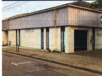
Salvation Army Shelter