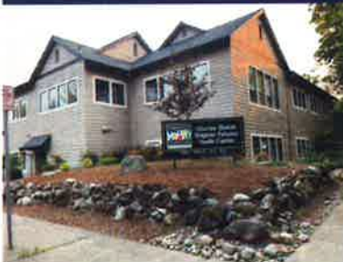
CYS-Rosie's Place Shelter