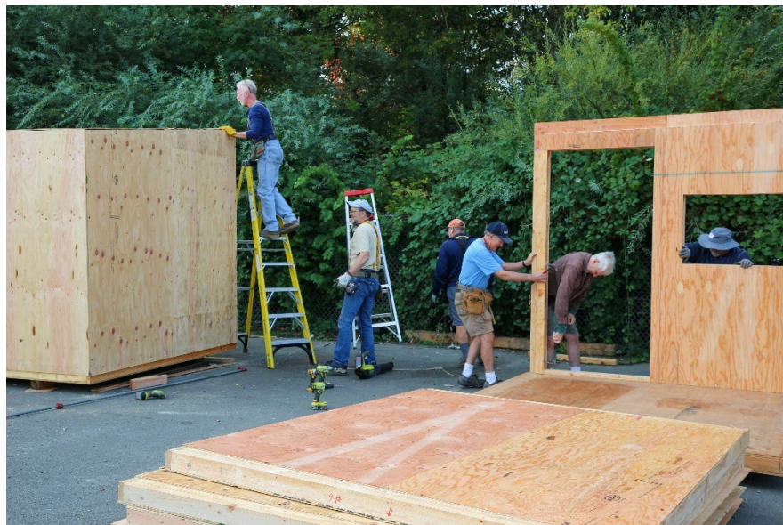
Community volunteers help build tiny homes for Quince Street Village.

People in our community may face challenges at different times in their lives, such as job loss, health issues, or other unexpected events that make it difficult to meet basic needs. Our community responds through a network of religious, charitable, and local government organizations working together to ensure everyone has access to the support and resources they need.