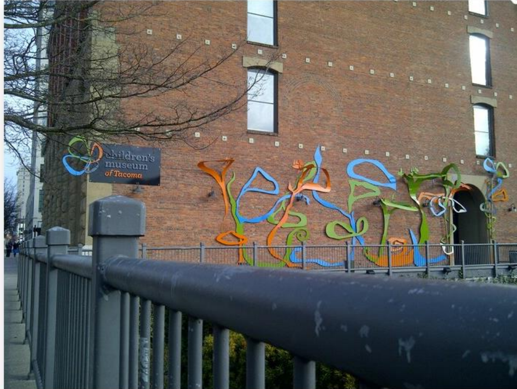
1 - Ish - for the Children's Museum of Tacoma