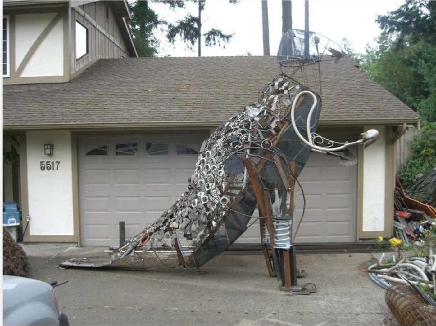
7 - Ms. Rusty Recyclasaurus recycled steel and mild steel pipe 12' x 16' x 5'