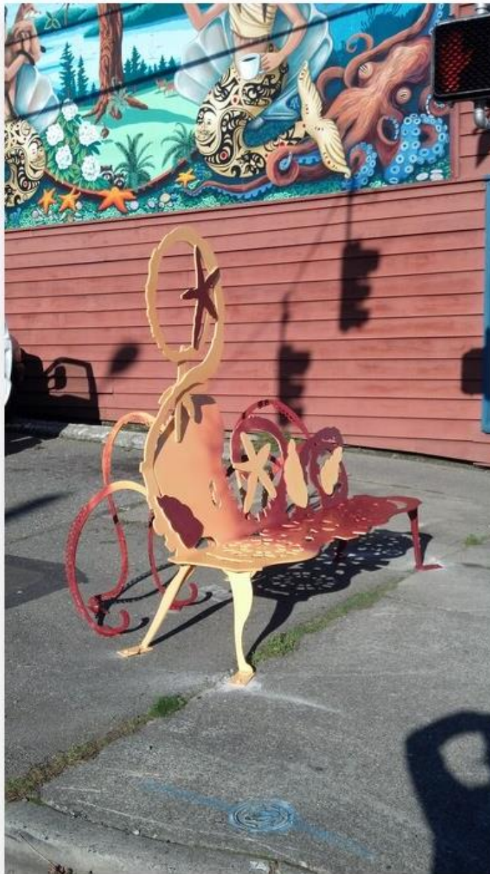
6 - Octopus Bench