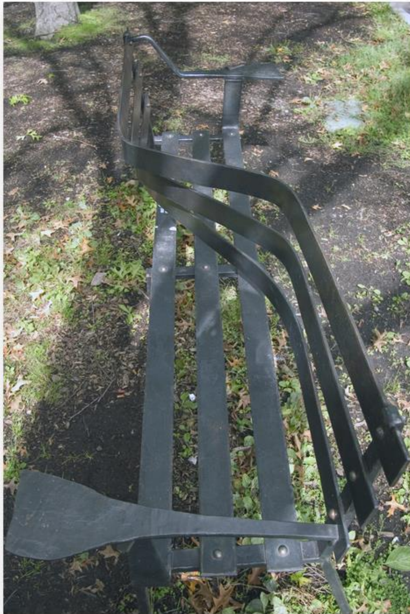
5 - Eastlake Green Street Sweetheart Bench