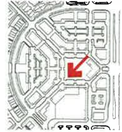
View from Town Square to South Kettle