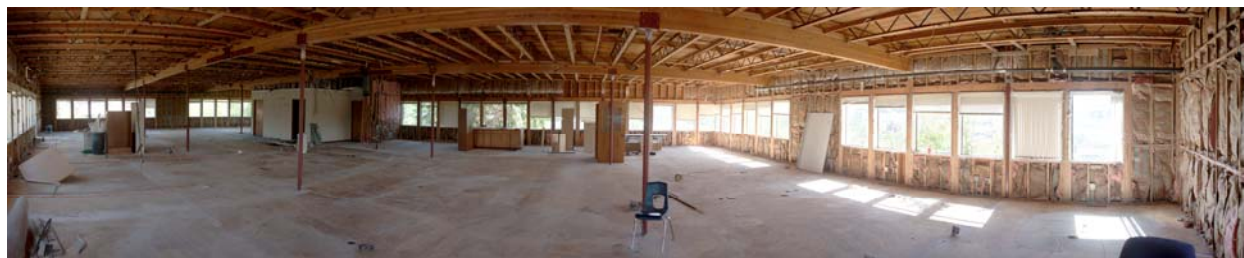
Demolition Completed: Family Support Center: Smith Building Family Housing Units Project First-floor Demolition Completed Summer 2013

Many projects funded by the City with federal CDBG monies also receive funding from a variety of other sources. They include other federal programs, the State of Washington, Thurston County, City of Olympia and private-sector money.