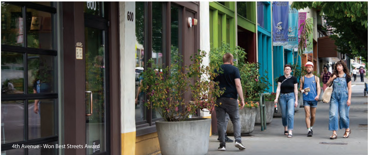
4th Avenue - Won Best Streets Award