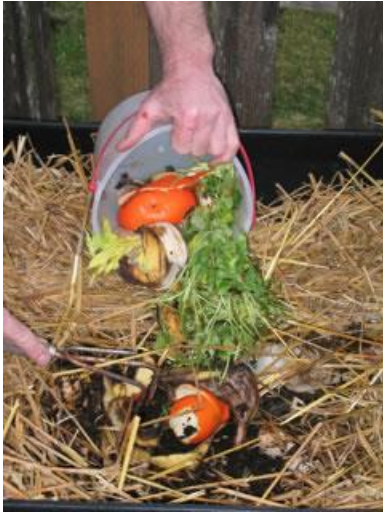
Compost at home to reduce waste.

The amount of waste collected per person each day in Olympia is increasing. This coupled with an increasing population, puts pressure on our already strained regional waste management system. Olympians can help solve these problems through a variety of regional and local actions.