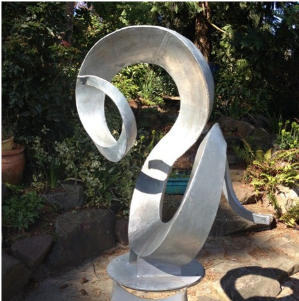
Full Curl Roger Squirrell, Lake Forest Park Galvanized Steel 36" x 24" x 24"