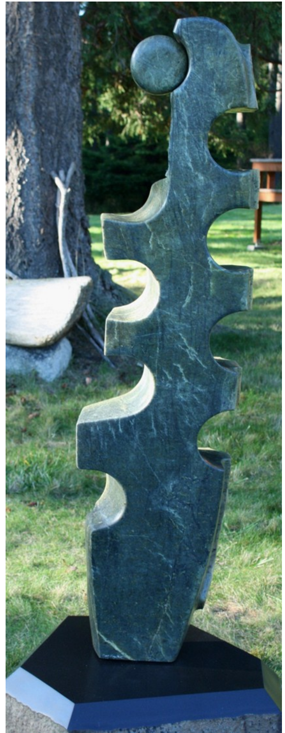
Vertebra: Ocean Verde