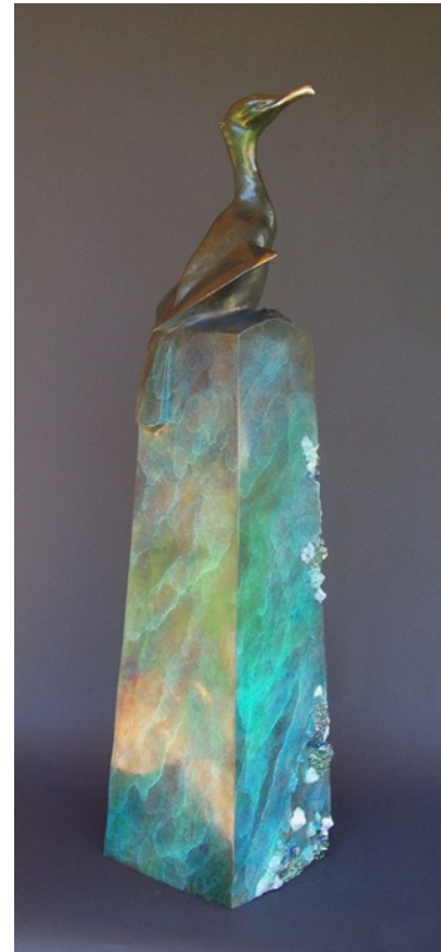
Illuminated One Leo E. Osborne, Anacortes Bronze 48" x 10" x 10"