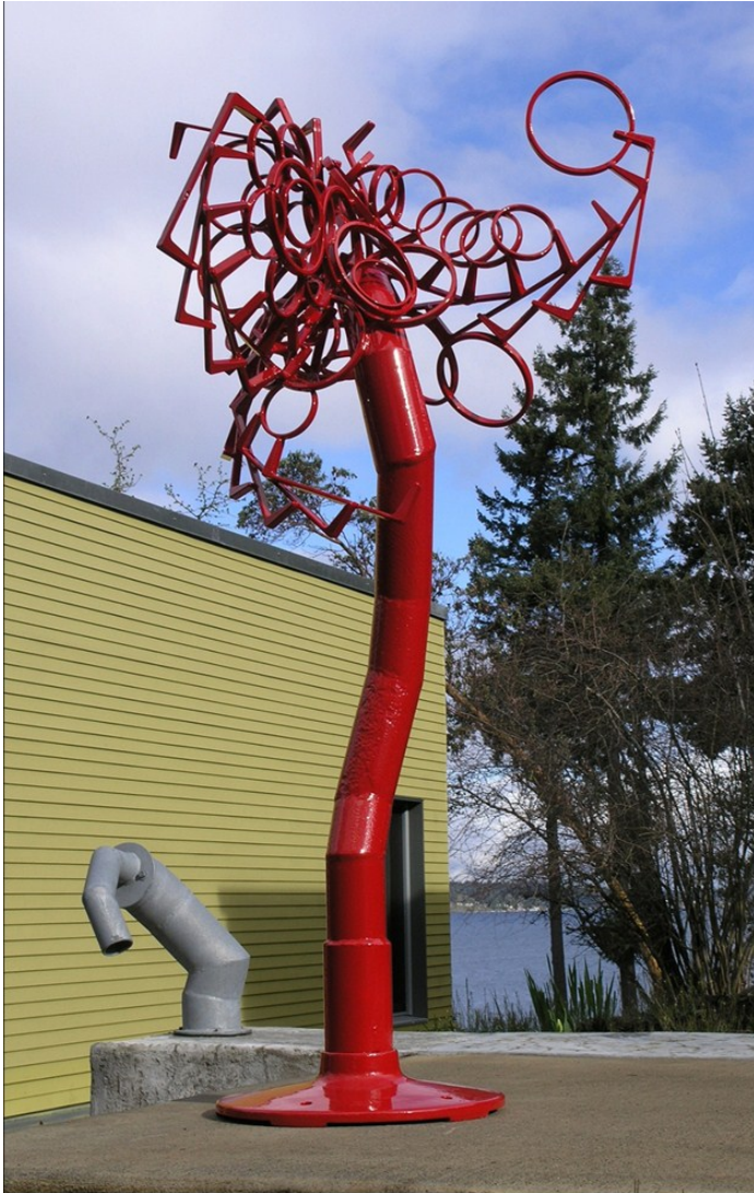
Opening (Ring Dance #9)