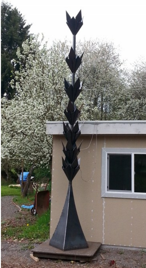
Origami #3-Totem Ken Hall, Lacey Folded and Welded Steel 16' x 22" x 22"