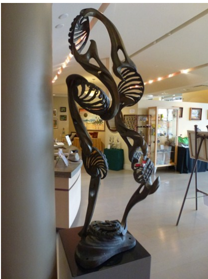
ALTERNATE From the Sea Hugh Buchholz, Olympia Bronze 48" x 15" x 21"