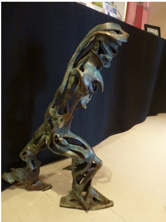
Figure in Motion