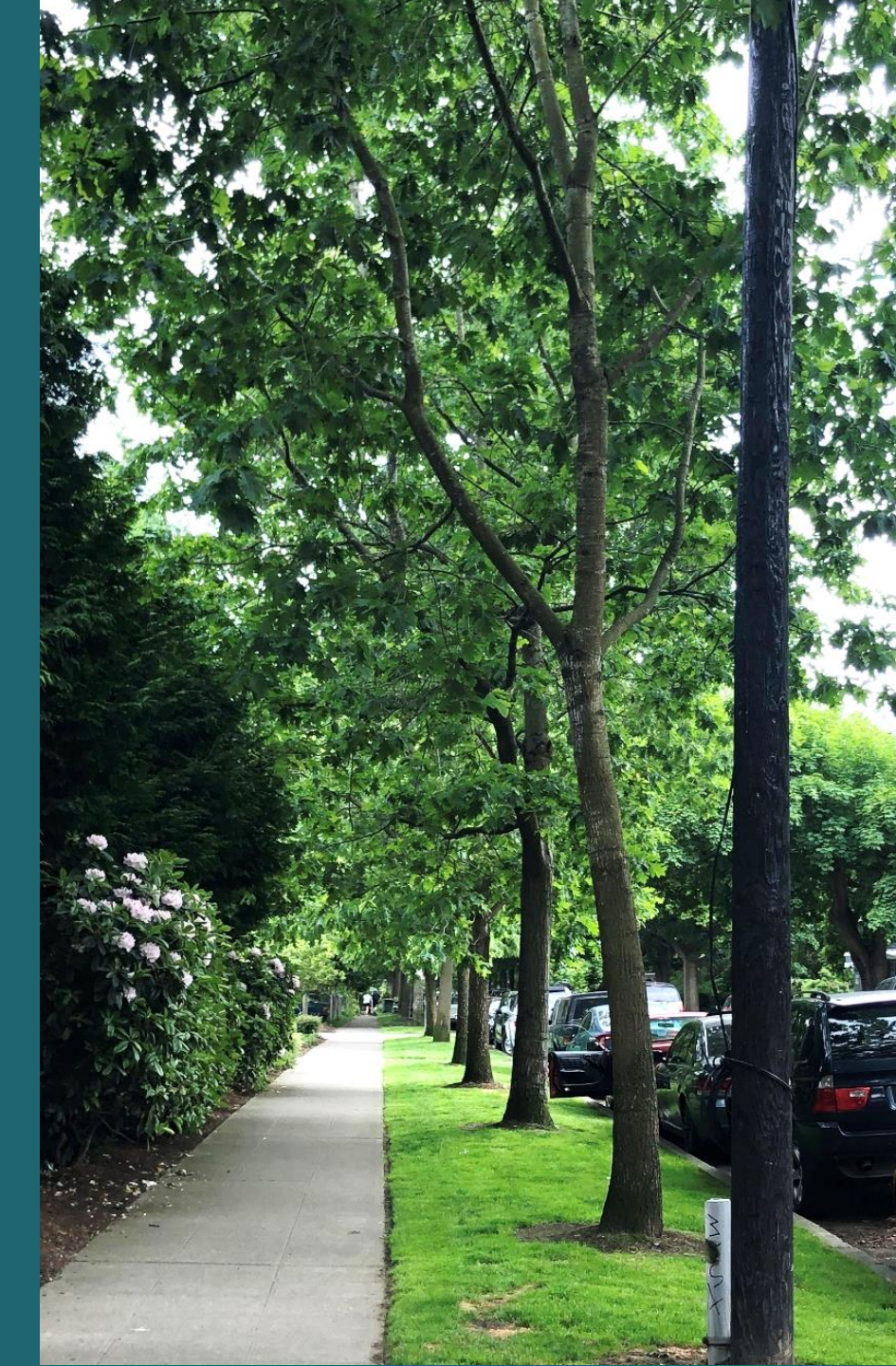
Photo: A row of oak trees along a grassy strip separates the street from the sidewalk