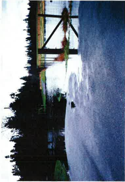
FEB. 1996 CASE PROPERTY