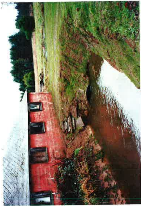
JAN. 2008 CHAMBERS DITCH ON THE CHASE PROPERTY & DITCH FROM: FULLER LN. FACING NORTH