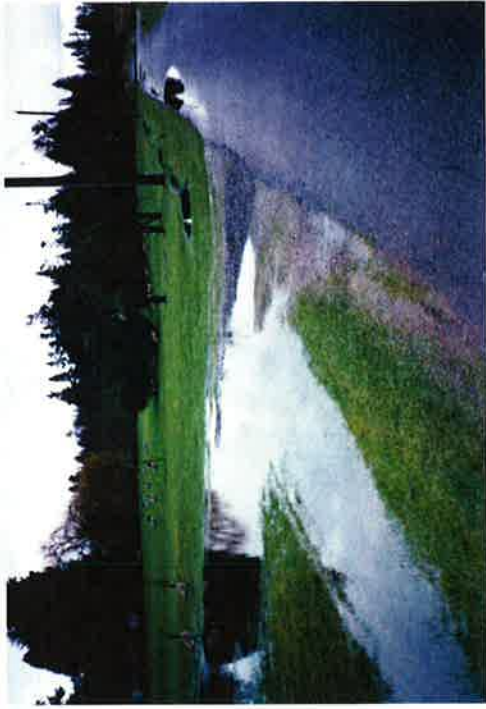
DEC. 1999 CASE PROPERTY & HOFFMAN'S DRIVE