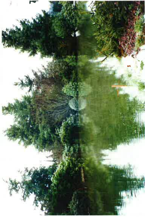
RISING'S PLACE FEB. 1996