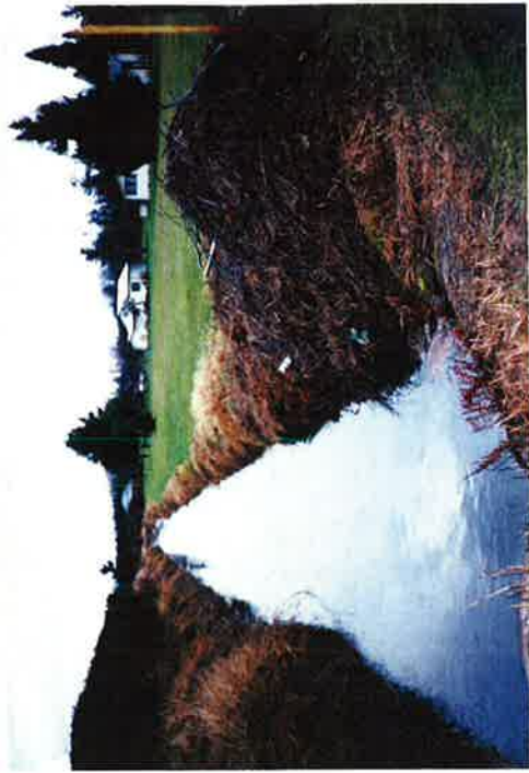
DEC. 2006 FULLER LN. & ENTRANCE TO: CHARE PROPERTY CHAMBERS DITCH N.