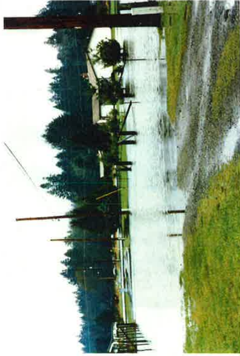
FULLER LN. CASE & RISING & HOFFMAN PROPERTY