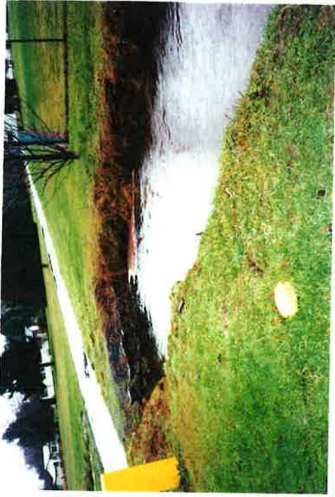
JAN. 2008 CHAMBERS DITCH ON FULLER LN. TO: WIGGINS RD.