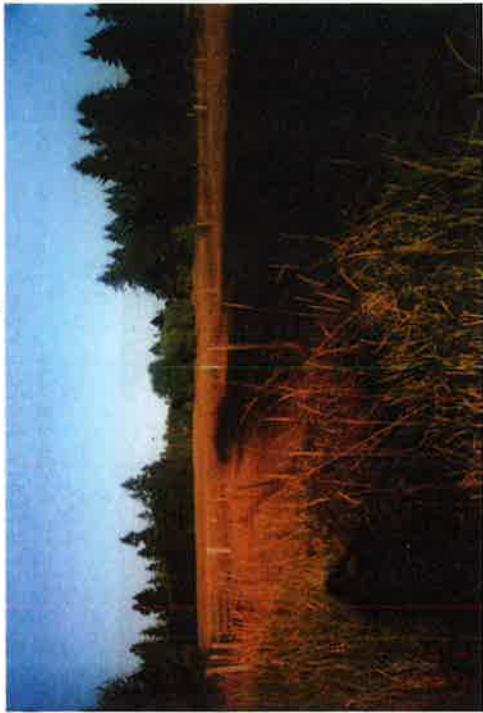
JULY 2008 THE PROPOSED POET'S COVE