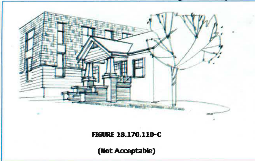
Illustration in OMC 18.170.110 showing an example of an unacceptable design not meeting code requirements

East elevation of the proposed Bing Street Apartments and an adjacent home on the corner of Bing Street and Jackson Avenue, showing the similarity to the example design in OMC 18.170.110 that is deemed “not acceptable”.