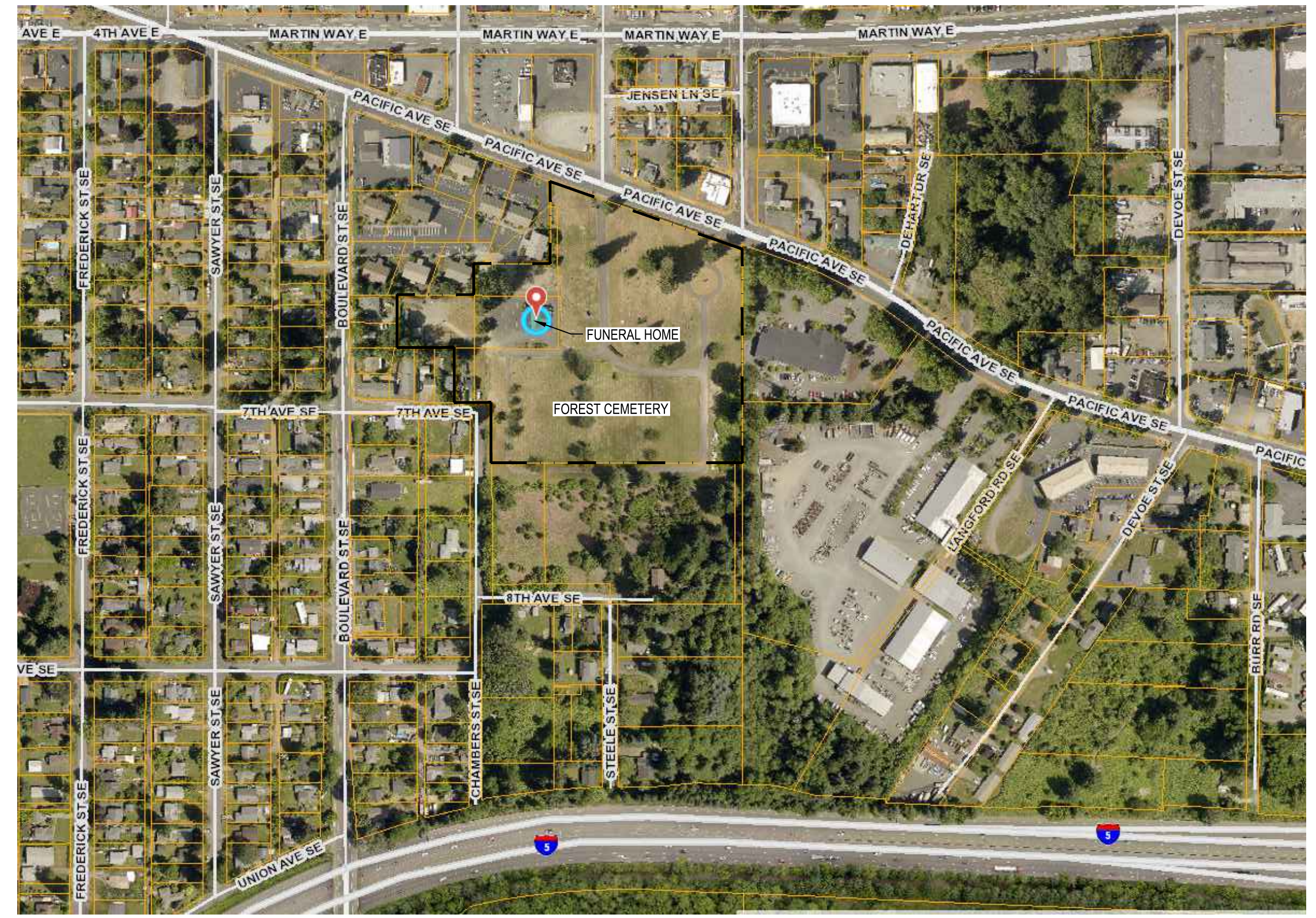
VICINITY MAP SCALE: N.T.S.