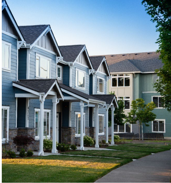
An Olympia neighborhood with a mix of apartments and town homes.

*Displacement is due to eviction, acquisition, rehabilitation, or demolition of property, or the expiration of covenants on rent or income-restricted housing.