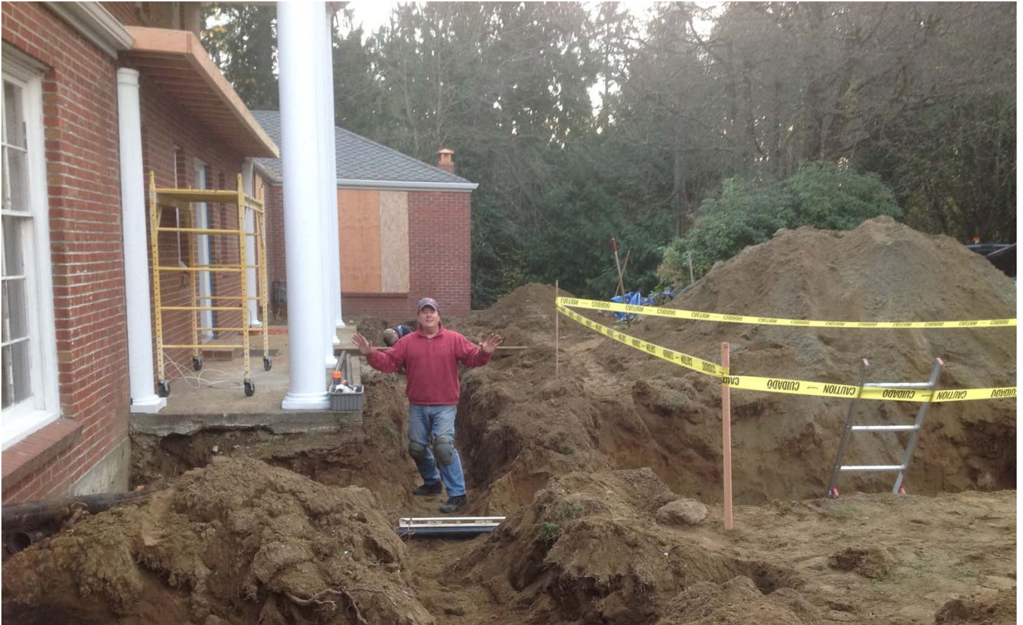
Sewer upgrades and rehabilitation work on the front porch and balcony.