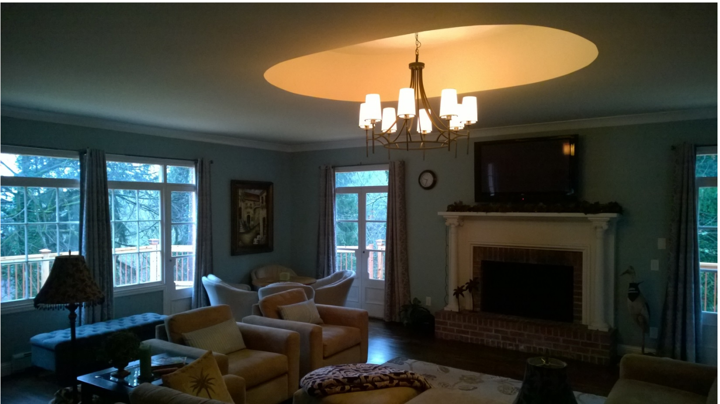
Ballroom – Fixtures and fittings restored to a high standard