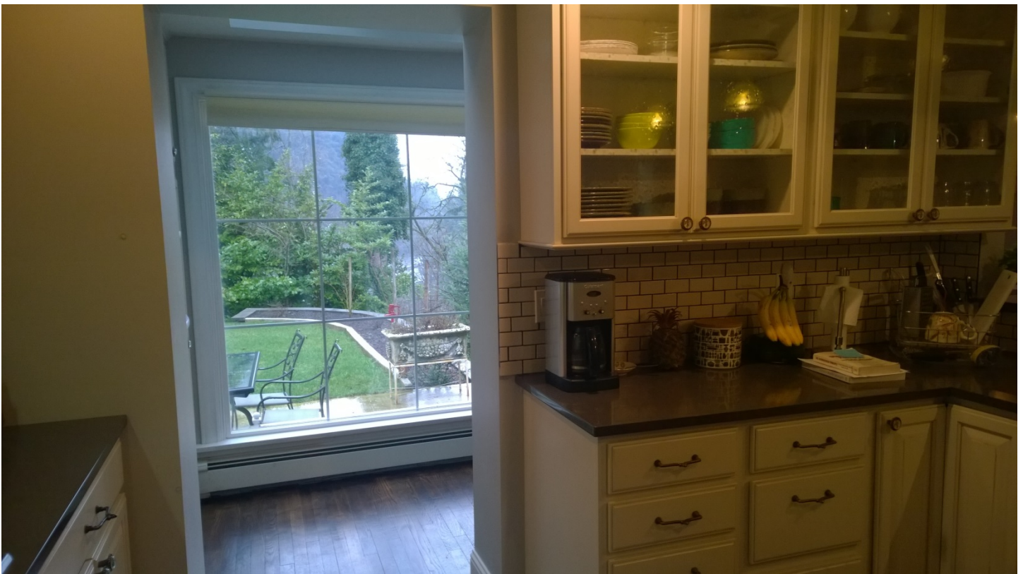
New Kitchen Buildout – Previous kitchen fixtures not original