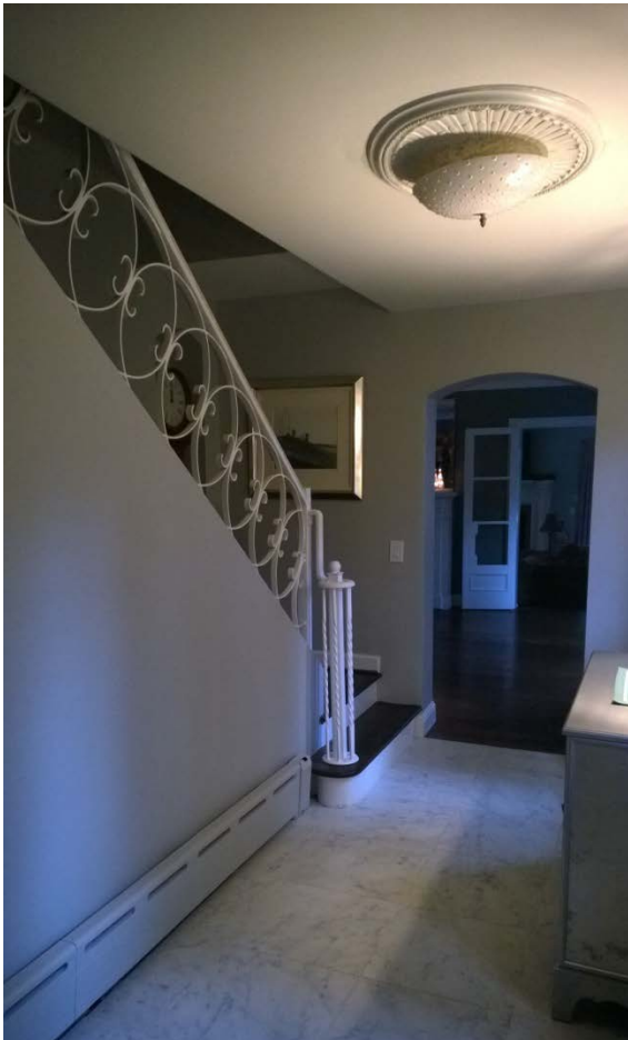
Front Entrance Hall – Original railings and radiators