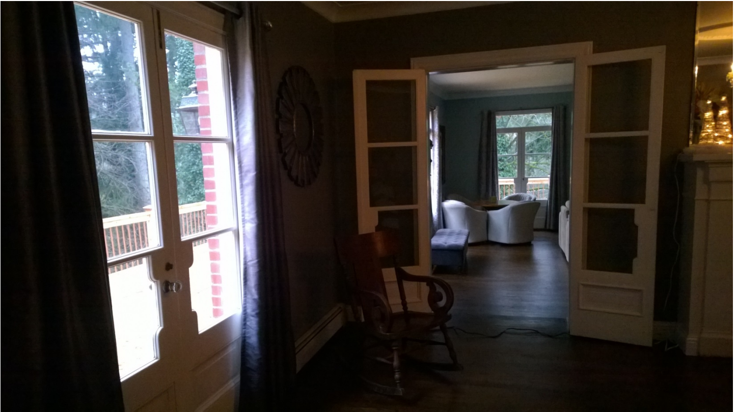
Dining Room and Ballroom Doors – Refurbished character-defining features