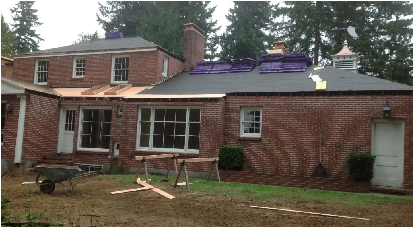
Complete reroof, gutter, and chimney rehabilitation.