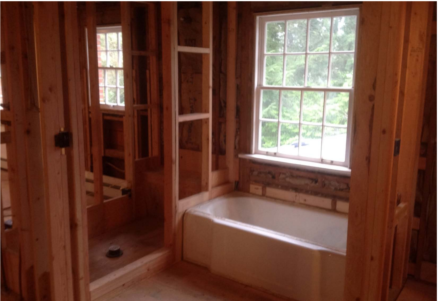
New master bathroom in the works.