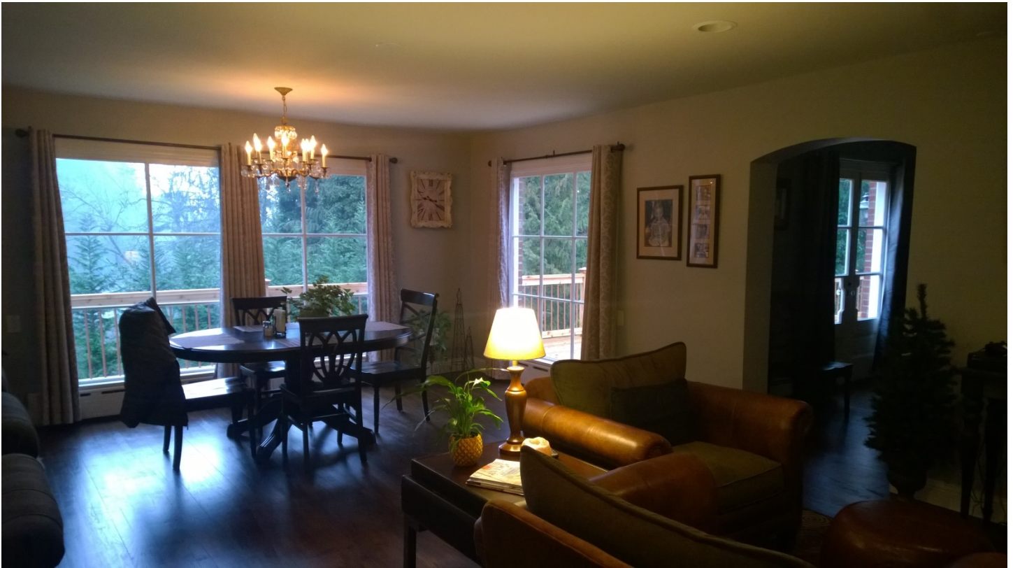
Family Room – Windows and floors refurbished