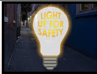
Clockwise from top left: Downtown Warming Center, Downtown Ambassador / Street Outreach Program, Business Training, Downtown Safety Projects, Housing Rehabilitation.