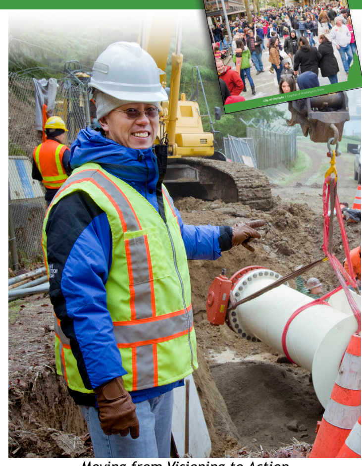
Moving from Visioning to Action