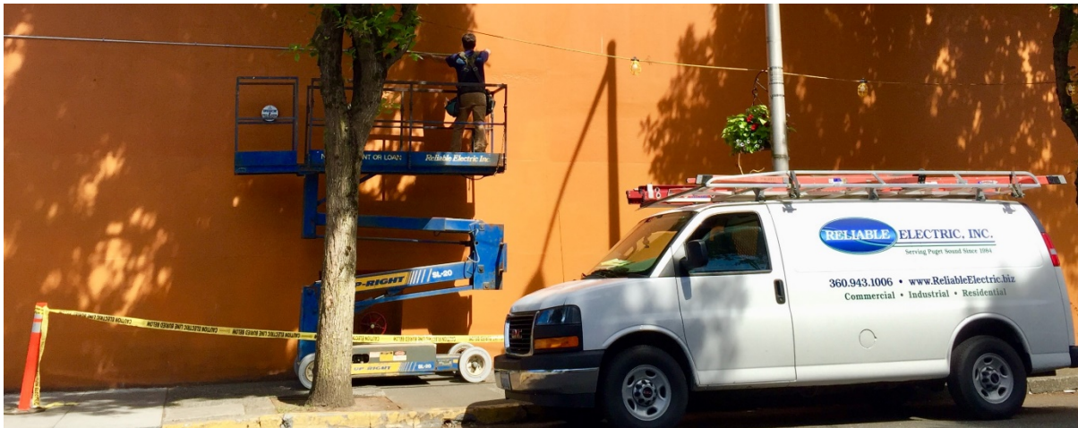
Downtown Safety Program – Completed the Crime Prevention through Economic Development Projects

Following are a couple of highlights from the Program Year 2019 Action Plan :