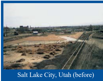
Salt Lake City, Utah (before)

The U.S. Environmental Protection Agency's (EPA) Brownfields Program provides funds to empower states, communities, and other stakeholders to work