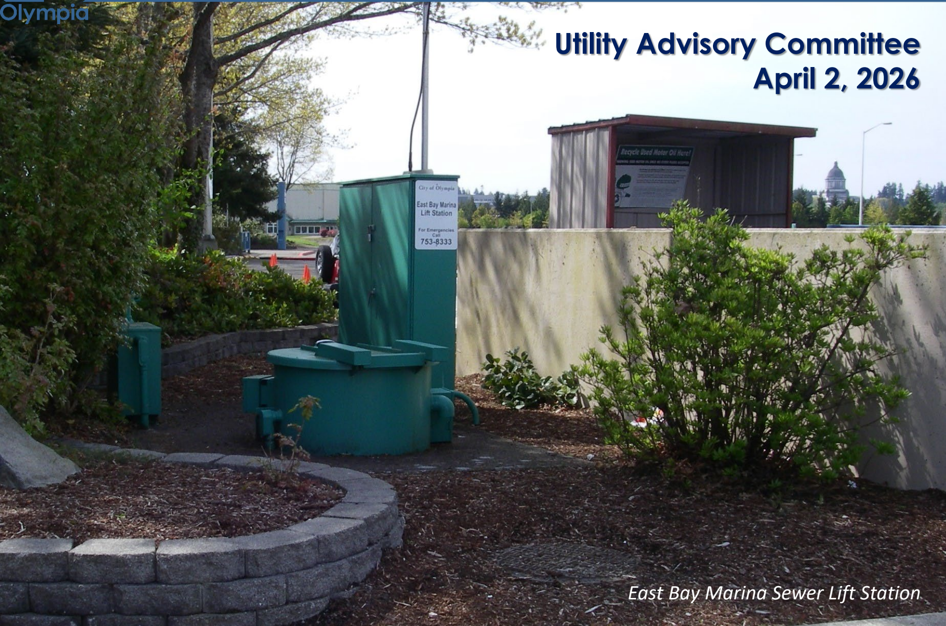
East Bay Marina Sewer Lift Station

Utility Advisory Committee April 2, 2026