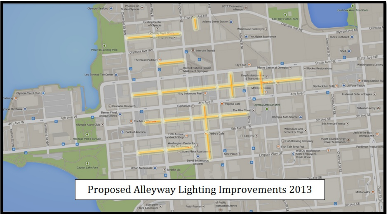
Proposed Alleyway Lighting Improvements 2013