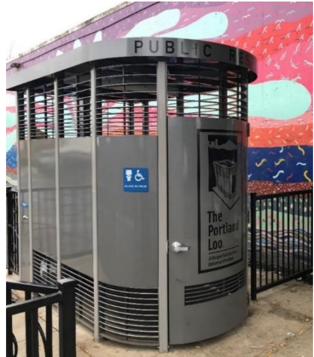
The Portland Loo was installed at the Artesian Commons Park, providing a public restroom open 24/7 .

Public Restroom Facility CDBG invested $97,102 to purchase a public restroom equipment – a pre-fabricated restroom facility. The facility was installed in the Artesian Commons Park located in Olympia’s downtown core. This public facility is available to all members of the public, however the primary beneficiaries are homeless, mentally ill and other street dependent people who have limited daytime access to restrooms during the day and zero access overnight.