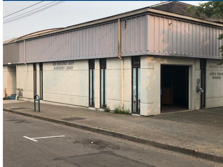
Salvation Army Shelter