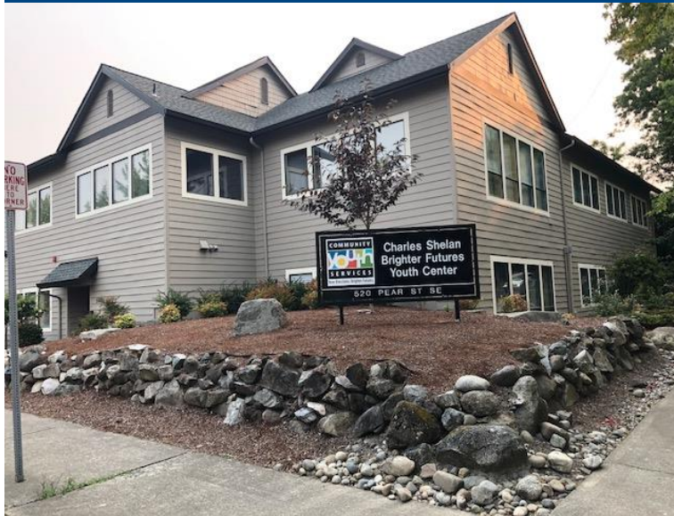
CYS-Rosie's Place Shelter