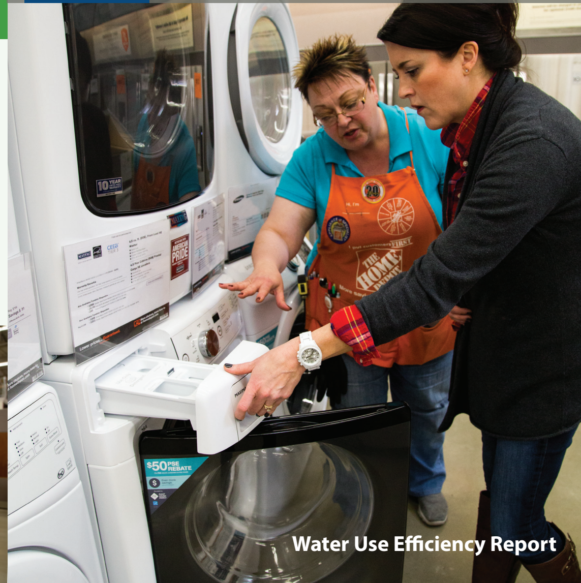
Water Use Efficiency Report