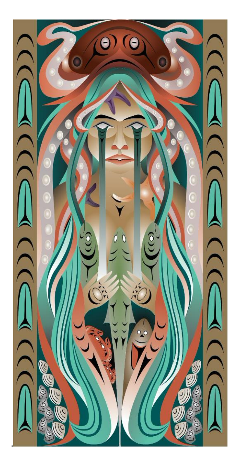
7. The artist's current resume.