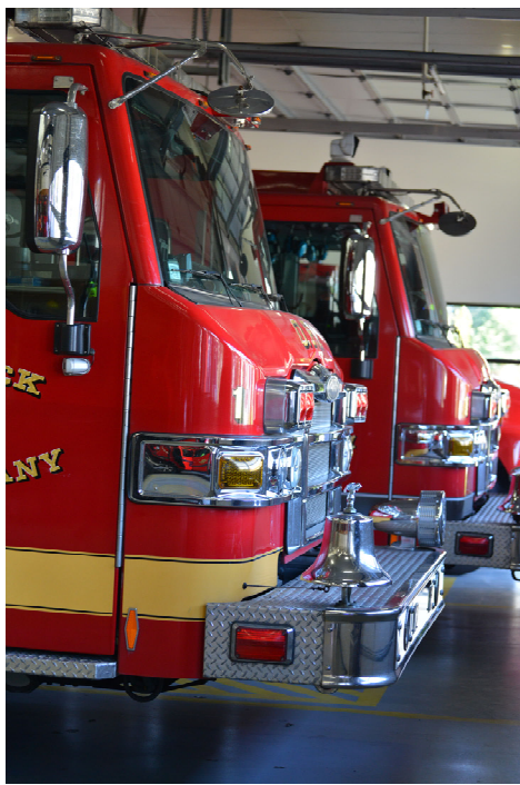
Olympia Fire Department vehicles.

The Olympia Fire Department (OFD) recruits, trains and retains highly capable professionals and provides them with the best available equipment and technology to protect the community and themselves. OFD is a core partner in the Thurston County Medic One System and other local and regional programs that seek to advance pre-emptive education, equity in service and reduce reliance on costly 911 emergency services. Additionally, the new CARES (Community Assistance, Referral and Education Services program) the Olympia Fire Department now provides services that will result in a healthier community and reduced reliance on the 911 Emergency system for non-acute concerns.