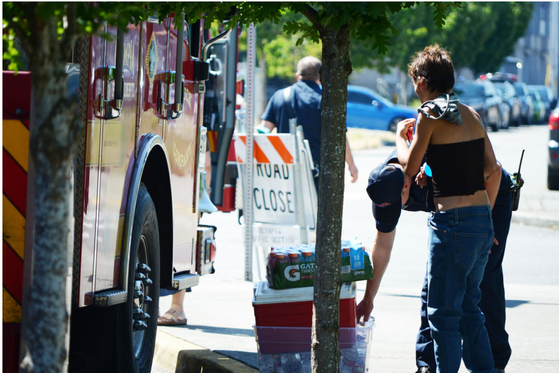
Olympia Fire personnel rendering assistance