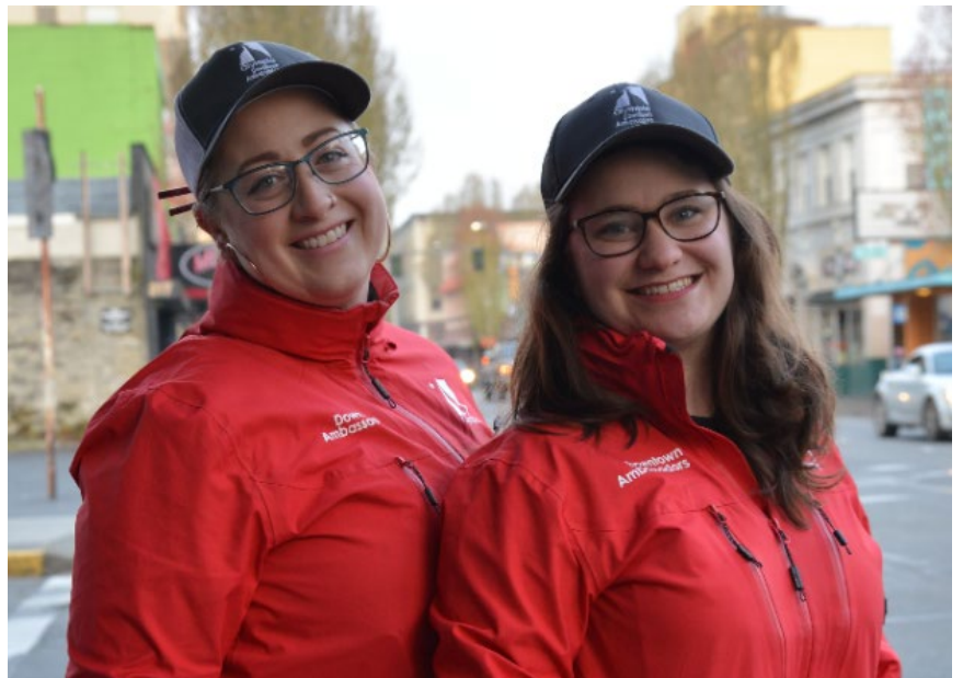
Downtown Ambassadors assist street dependent homeless and mentally ill people.

The City funded the Downtown Ambassador Program, first through the Capital Recovery Center, then bringing the program in-house. This team provided services and referrals on 3,414 occasions for homeless, mentally ill and street dependent people in Olympia’s urban hub. This program is paired with the City-funded Downtown Clean Team that provides downtown clean-up services. The City allocated $55,000 and expended $52,089.07 in CDBG funds.