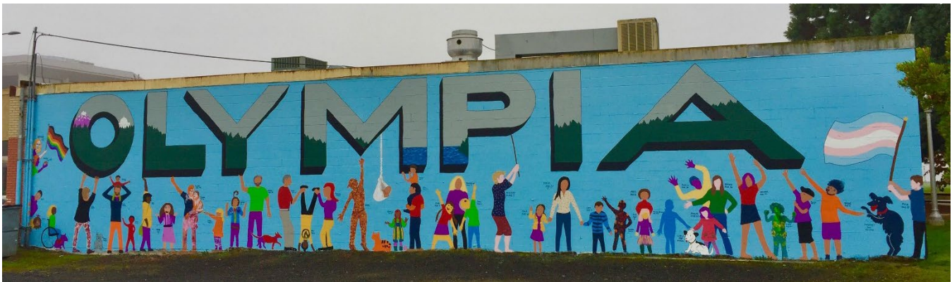
A recently completed mural titled "Holding Up Olympia" , by artist Chelsea Baker and friends of all ages, exemplifies the broad community development goals of the Olympia CDBG Program.

The Council has already developed the next Five-year Consolidated Planning period (2018 – 2022) with new CDBG-eligible strategic goals based on current conditions. That Consolidated Plan can be viewed at Olympiawa.gov/CDBG .