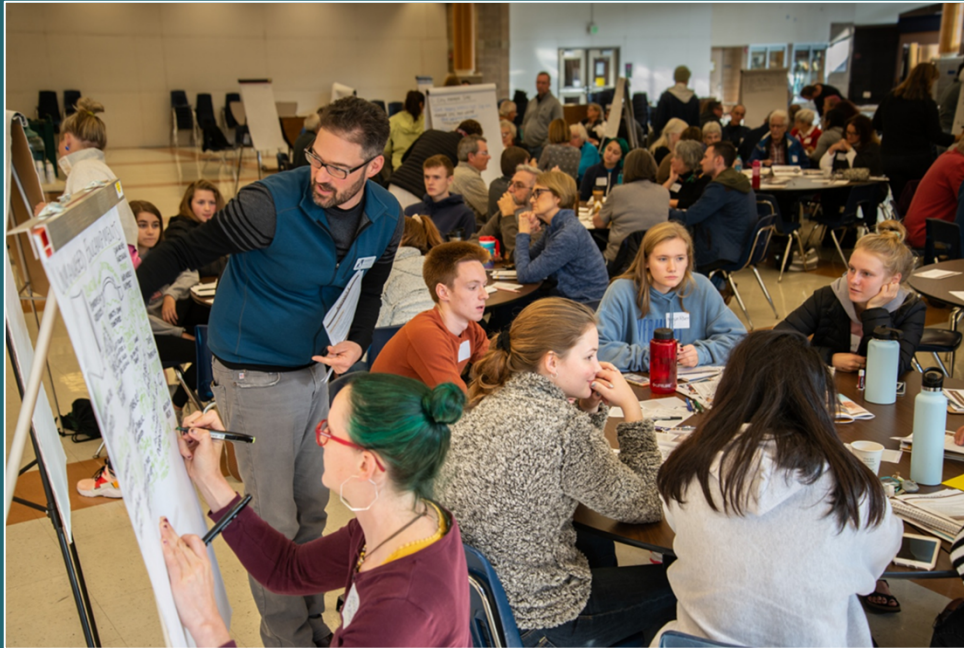
Youth attending a homeless response public meeting