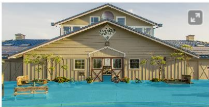
Olympia's Farmers Market

Low Projected Year: 2072 / Projection: 2053 / High Projected Year: 2031