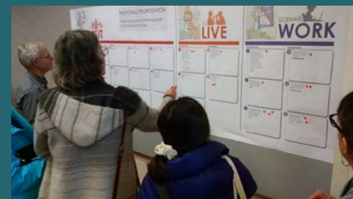
Then we asked what actions would improve living, working, and visiting downtown.