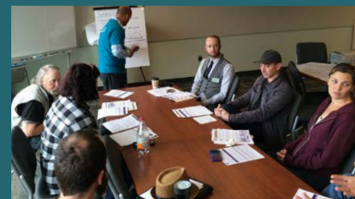
Finally, we discussed specific strategies for meeting downtown goals, like tools for housing affordability and landmark views preservation.

The Downtown Strategy ties together many community conversations and reflects local values and goals.