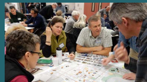
We began the process by asking participants about their goals for downtown, including where and what types of residential and other development they would like to see.

Through five public workshops, four online surveys, nine Stakeholder Work Group meetings, multiple City Council and Land Use and Environment Committee briefings and discussions, and many meetings with targeted participants (e.g., social services and affordable housing providers, retailers, developers, architects, and arts and theater representatives), we are confident the Downtown Strategy represents community views.