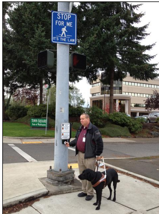
The CDBG-funded Audible Signal Project makes busy crosswalks Safer for sight-impaired pedestrians to cross the street

Second Year of a Three-Year Consolidated Plan Fiscal Year September 1, 2011 - August 31, 2012 (PY 2011)