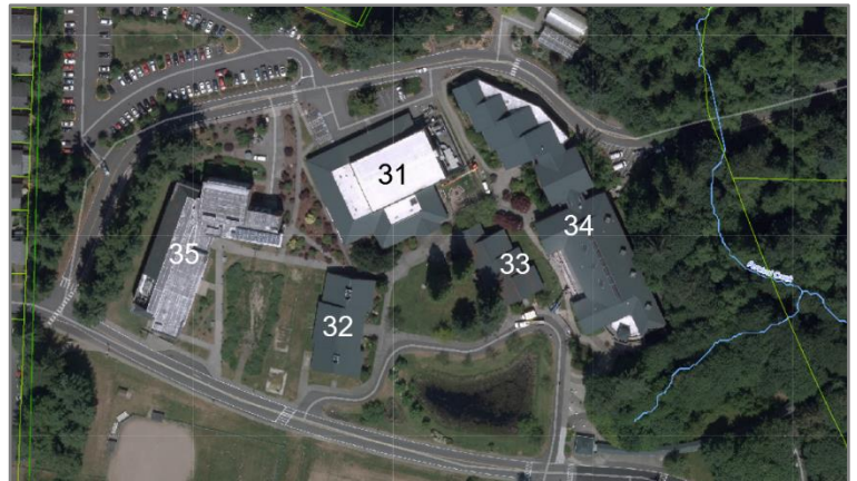
Figure 2: Aerial View of Buildings 31-35. ZOOM V 1.0. C.McCoy.

City staff have received no written comments to date specific to the design of the project, or specifically directed to the Design Review Board for consideration of the project. The Design Review Board meeting is a public meeting and as such public testimony or comments are not accepted, however the Board will accept written comments submitted in advance of the meeting.