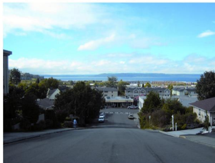
View with architectural detail