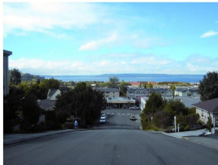
View with new building massing