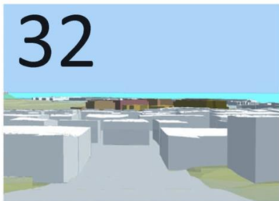
Model (new buildings in color)