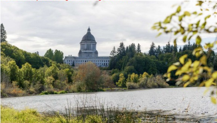
View of the Capitol Building