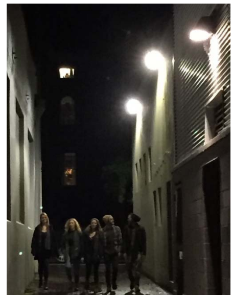
Alley Lighting, Phase 2 the City invested $194,000 to make alleys safer for pedestrians. Above people go to Artswalk Fall 2016 via well-lit alleys.

Olympia Timberland Library 313 8 th Ave. South East, Olympia