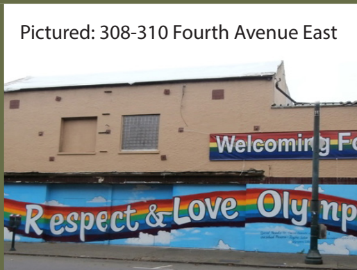
Pictured: 308-310 Fourth Avenue East