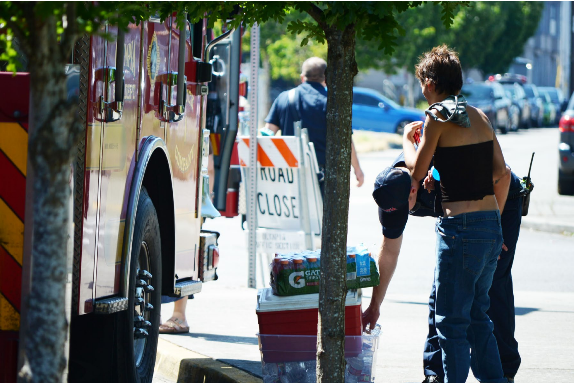
Olympia Fire personnel rendering assistance

The Department’s core values include: stewardship, integrity, compassion and professionalism. The OFD mission is to respond rapidly, with highly training professionals to mitigate emergencies for our community. We are dedicated to reducing risk through prevention, fire and medical education, and disaster preparedness.