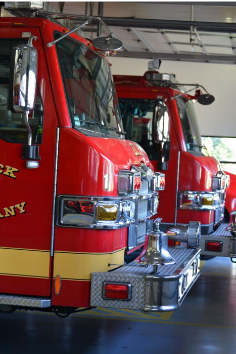
Olympia Fire Department vehicles.