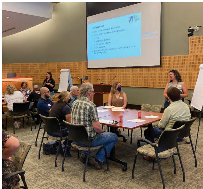
Table 2. Community Project Team

Community members and City staff worked side-by-side through a process facilitated by ICLEI (Local Governments for Sustainability) consultants to ensure an accurate reflection of Olympia. The group met five times between May and October 2023.