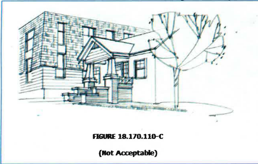
Illustration in OMC 18.170.110 showing an example of an unacceptable design not meeting code requirements

East elevation of the proposed Bing Street Apartments and an adjacent home on the corner of Bing Street and Jackson Avenue, showing the similarity to the example design in OMC 18.170.110 that is deemed “not acceptable”.